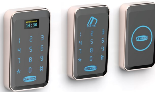
RY02U-4 ( Proximity Reader)